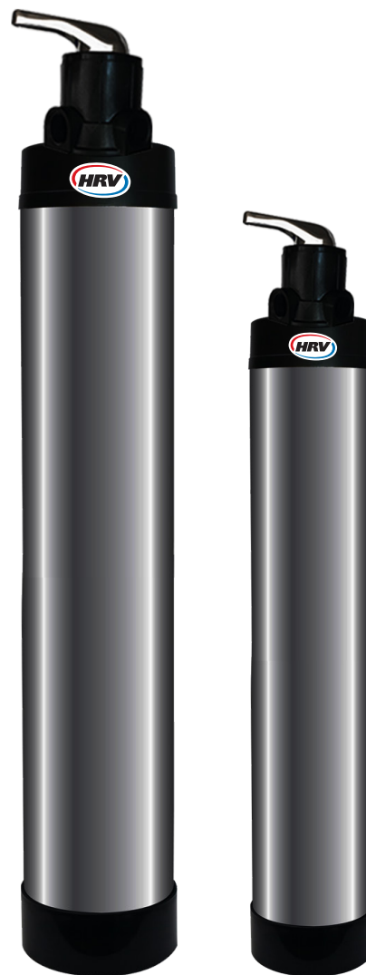
WAT SYS WHCS-1054SM