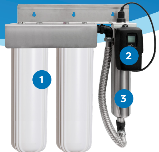
WAT SYS AUVHC-J3M

Larger Home: 2-3 bathrooms (2+ bedrooms)