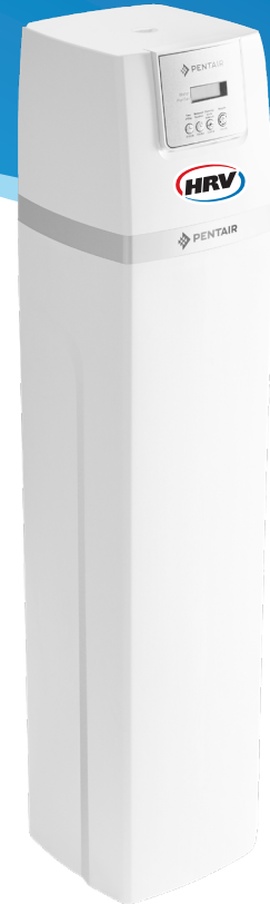
WAT SYS WHWP-1040A