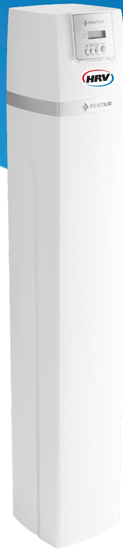
WAT SYS WHWP-1054A