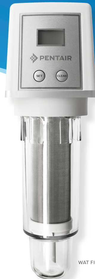
WAT FILT PHSF-A