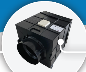
Core ventilation unit