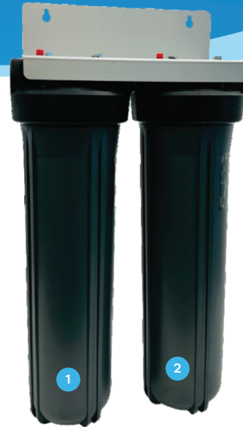
WAT SYS AFHK-TJWI