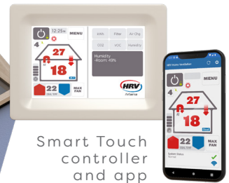
Smart Touch controller and app